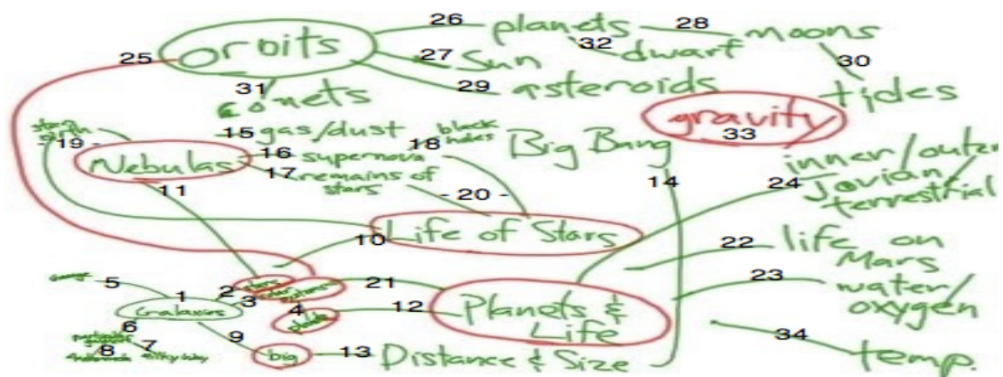
Figure 2. Concept map generated through the first metacognitive meeting in Class B. Circled terms represent major themes identified. Numbers show the sequence by which the terms and links were added.

Another metacognitive meeting was held on October 21. With the concept map (Figure 2) displayed on the digital whiteboard, students reviewed progress made in areas indicated by the existing concepts and identified new key concepts that had not been explored much yet. In reflection of students’ deepened understanding, a new concept, “satellites,” was added to the map and connected to “orbit” as well as “moons.” Issues related to orbit (B6 in Figure 1) and satellites (B14) became a focus in the online discourse and were addressed at a much deeper level than in Class A.